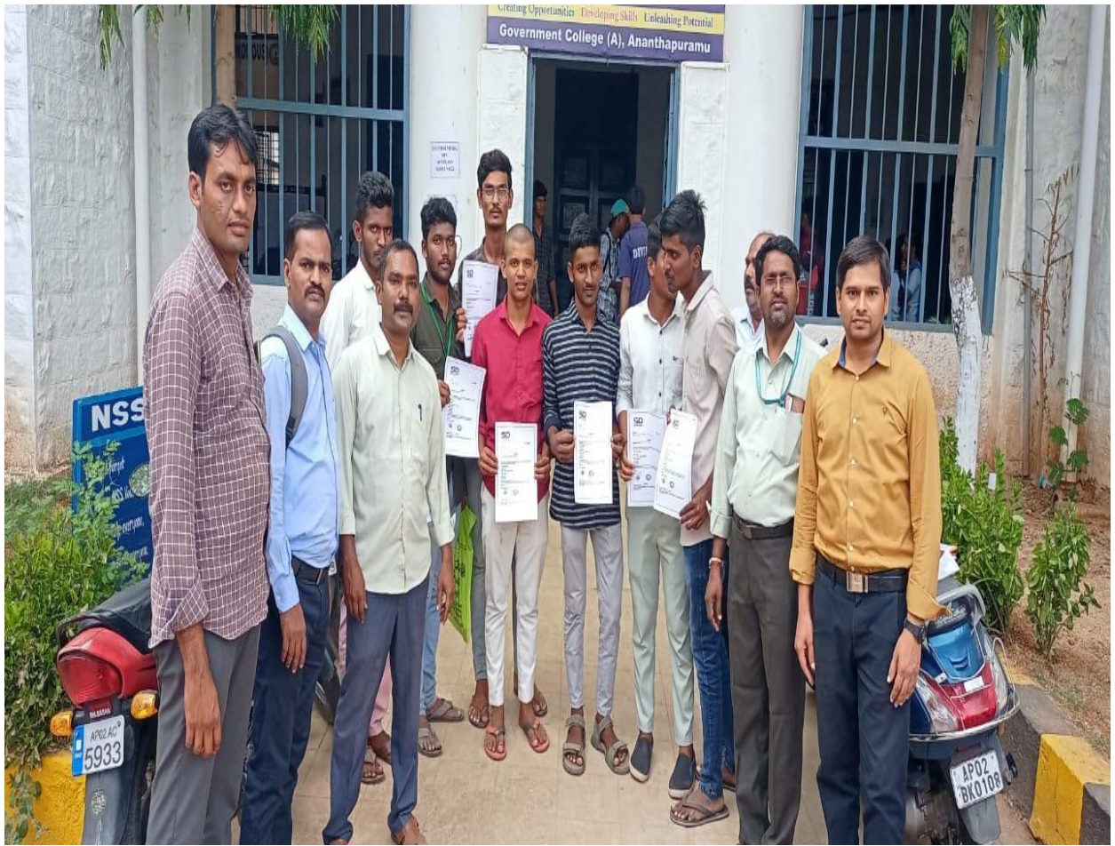
Students participating in Maha Job Mela at Government College (A), Ananthapuramu